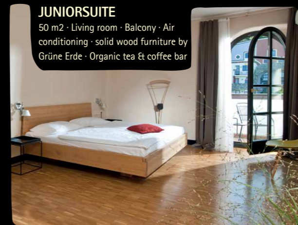
JUNIORSUITE 50 m² · Living room · Balcony · Air conditioning · solid wood furniture by Grüne Erde · Organic tea & coffee bar