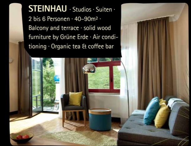
STEINHAUS · Studios · Suiten · 2 bis 6 Personen · 40–90m² · Balcony and terrace · solid wood furniture by Grüne Erde · Air condi- tioning · Organic tea & coffee bar