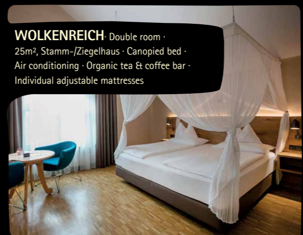
WOLKENREICH · Double room · 25m², Stamm-/Ziegelhaus · Canopied bed · Air conditioning · Organic tea & coffee bar · Individual adjustable mattresses