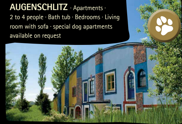
AUGENSCHLITZ · Apartments · 2 to 4 people · Bath tub · Bedrooms · Living room with sofa · special dog apartments available on request