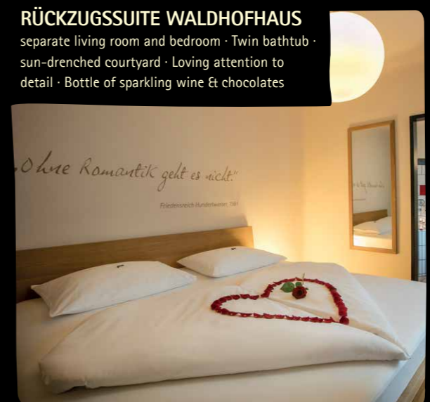
RÜCKZUGSSUITE WALDHOFHAUS separate living room and bedroom · Twin bathtub · sun-drenched courtyard · Loving attention to detail · Bottle of sparkling wine & chocolates