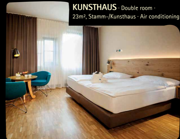
KUNSTHAUS · Double room · 23m², Stamm-/Kunsthau · Air conditioning