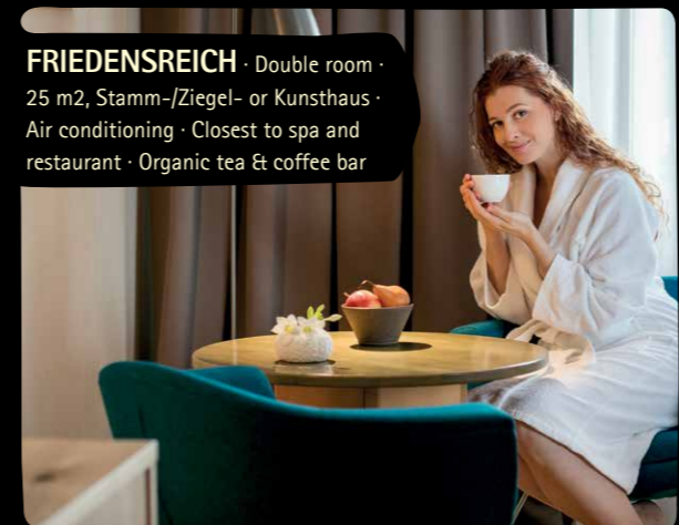
FRIEDENSREICH · Double room · 25 m², Stamm-/Ziegel- or Kunsthau · Air conditioning · Closest to spa and restaurant · Organic tea & coffee bar